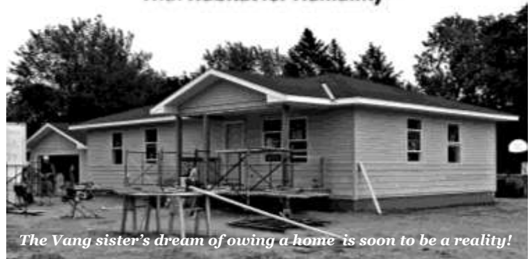
The Vang sister's dream of owning a home is soon to be a reality!