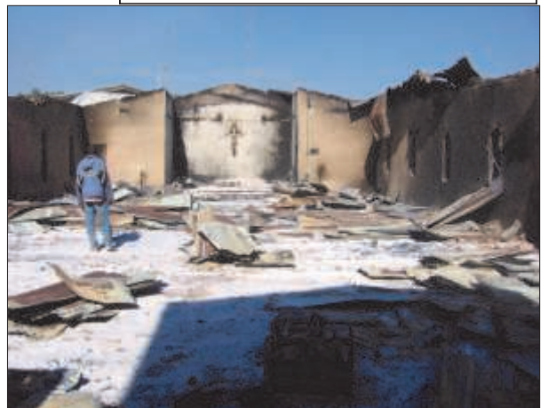
Block walls are all that remains of the Dogon Karfe Church in Jos, Nigeria

See next month's newsletter for updates in the areas of water and health care!