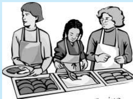
Sharing and Caring